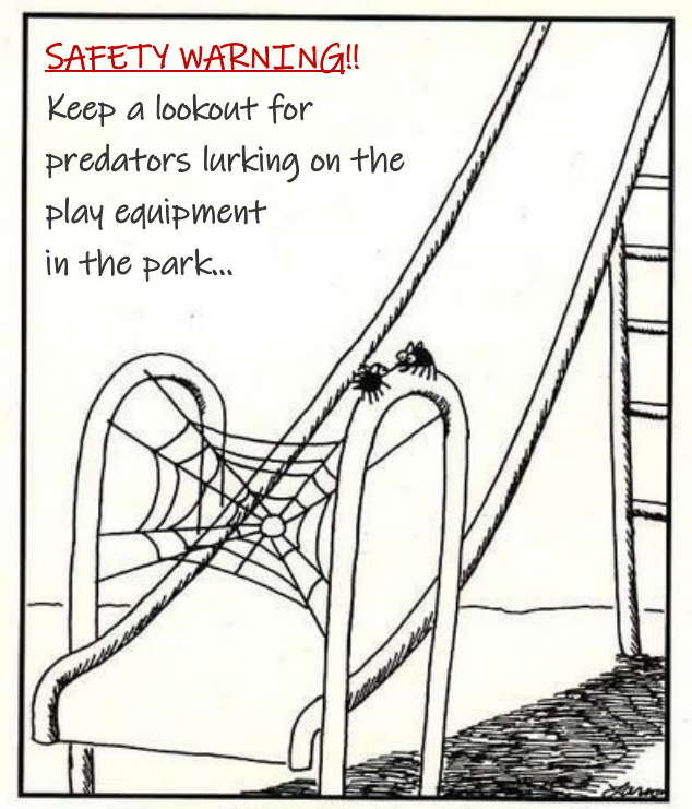
"If we pull this off, we'll eat like kings."

WANTED - 903 Cummins engine, reasonable runner. Contact Frank 0419 764 200